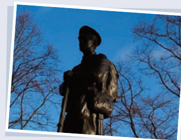
Heath Town Park