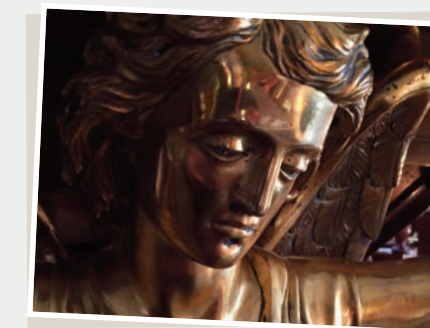
Bantock Park Museum