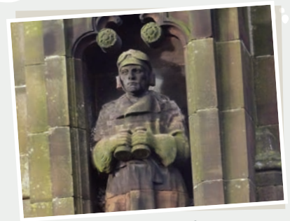
Servicemen Memorial Airman